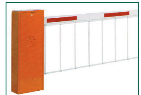
Skirted beam kit

FAAC is the world's largest specialized manufacturer of automatic gate operating equipment.