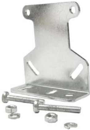
P-NIR6 Brkt and Hdw.