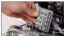
telephone access systems use a modular design concept that makes installation and service easy